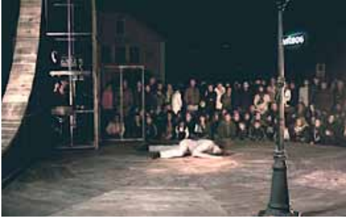
55 presentations CH-F-NL