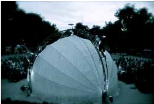
95 presentations CH-I-F