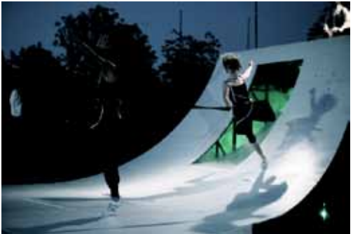
60 presentations CH